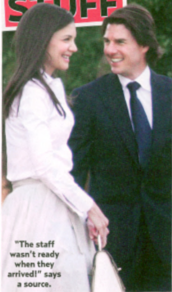
"The staff wasn't ready when they arrived!" says a source.